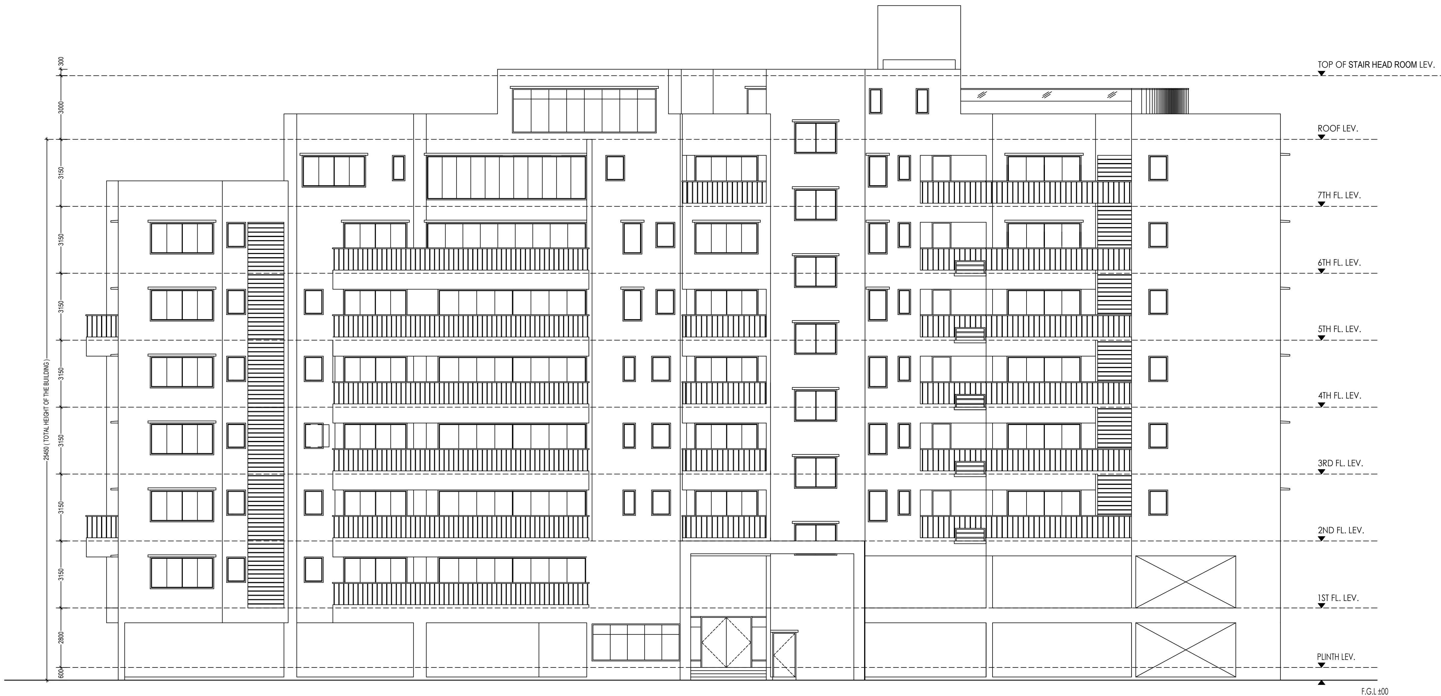
FRONT ELEVATION (BLOCK-A) SCALE - 1:100